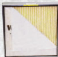
Stage 2 - Part Number 11205 4" Metal framed pleated intake filter for greater surface area allowing air to pass at lower velocity capturing particulate down to five (5) microns. Cleanable Life Expectancy 3-6 months depending on frequency of use and material used.

Cleanable Life Expectancy 3-6 months depending on frequency of use and material used.