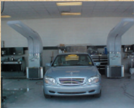
"Cleaner shop environment"