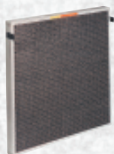
Stage 3 - Part Number 11209 2" - 7 lb Activated carbon filter, removes VOCs, ISOs, toxic fumes and odors Not Cleanable Life Expectancy 6-9 months depending on frequency of use and material used.