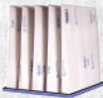
Stage 4 - Part Number 11207 Viledon discharge top pocket filter. Large surface area for depth loading. 98% Average Dust Spot Efficiency. Not Cleanable Life Expectancy 6-12 months depending on frequency of use and material used.