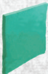
Stage 1 - Part Number 11704 Pre-filter pad, fiberglass paint arrestor filter with Tackifier

Important: Never substitute ICA's OEM filters for other brands that may look-a-like and cost less. They will not perform properly to stringent factory specifications and they will not seal properly causing dirty air to by-pass the filtration process harming the machine thereby jeopardizing employee safety and voiding factory warranty.